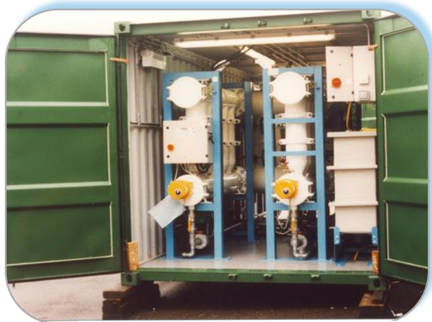
One of Six Filter Containers Total Flowrate: up to 15,000 gpm