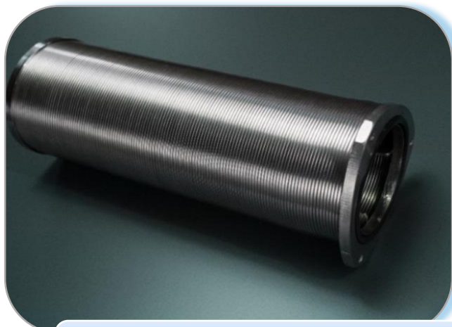
Proprietary ZGF Spring Filter element