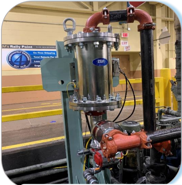
Maggie MG2600 automatic, in-line magnetic separator protects engine block finish hone