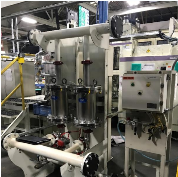
ZGF Maggie MG1200, 2-Station with SD+

Scrap / Size Excess Faults Reduced by 93.5% in 3 months