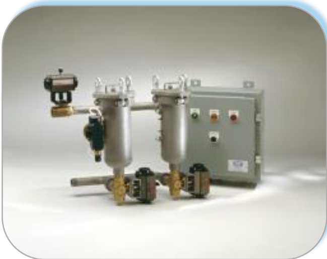
EZ Clean EC100 Duplex Automatic Filter with Controls Flowrate: 20 gpm