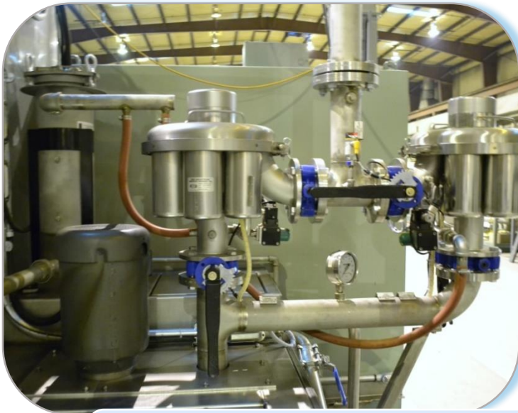
The ZGF Phoenix filtration system is the most advanced, automatic, non-disposable, liquid filtration system