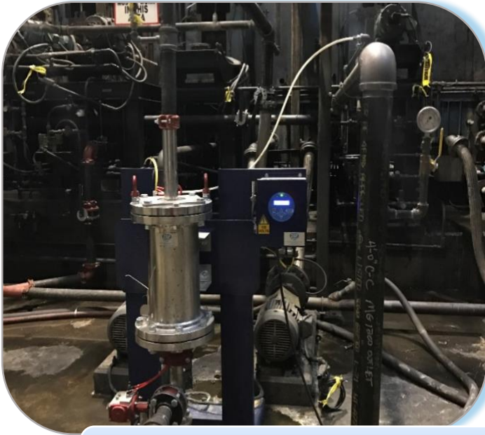
Maggie MG1200 rated at 125 gpm Stage #2 - Alkaline