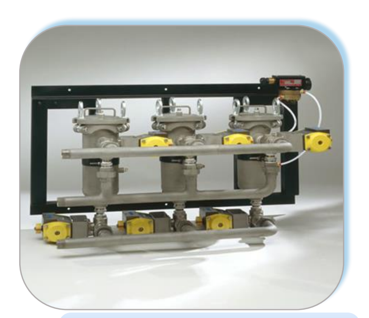
EZ Clean EC100, 3-Pod Flowrate: 15 gpm Process Temperature: 190°F

Each EC100 Pod has (1) proprietary ZGF Spring Filter element with a 50µ Absolute Gap